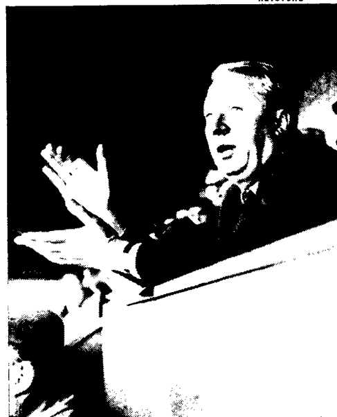
HEATH Full cry.

Of course, a landslide victory had also been forecast for Harold Wilson's Laborites 17 months ago. Instead, they barely broke 13 years of Tory rule, taking office with only a five-seat ma-