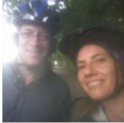
BIBLE MYSTERIES By Tim McHyde / June 4, 2016